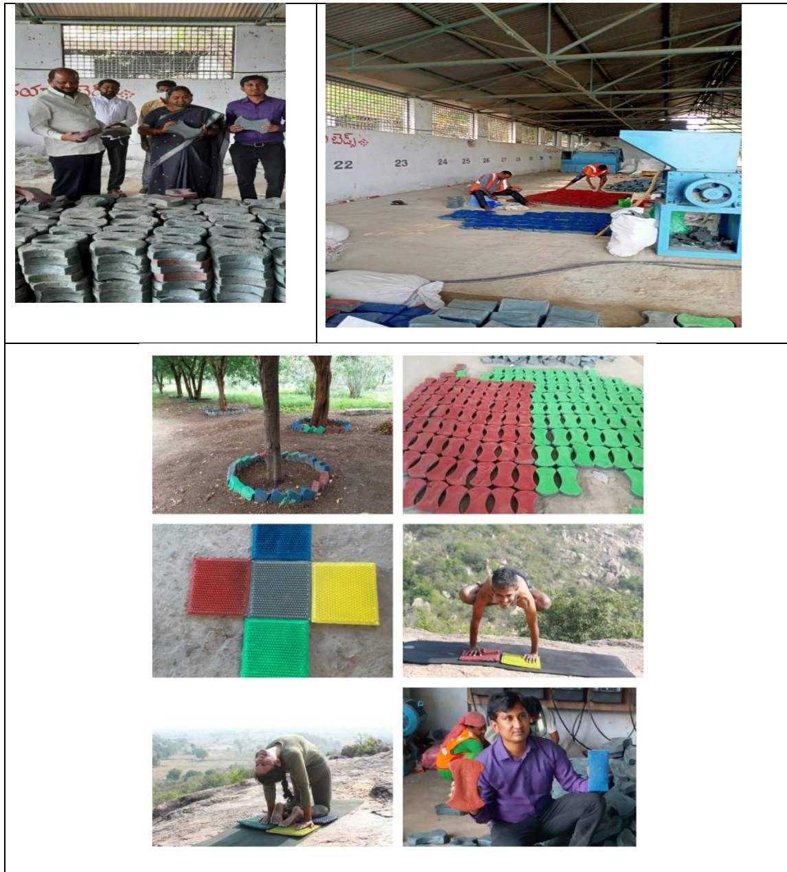
Figure 2.3: Outcomes of plastic waste recycling