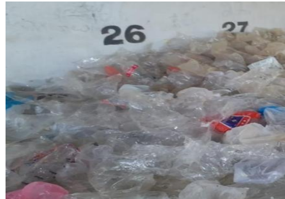
Figure 2.1: Showing plastic waste separated, collected and deposited in dumper machine.

Step 2: After cleaning, the plastic will be sent for Granule machine processing. Plastic comes out as granules or plastic chips.