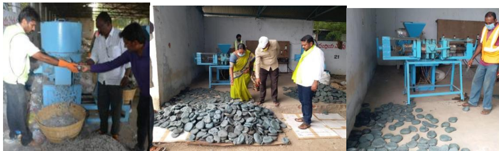
Figure 2.2: Granule machine or also called polythene chips maker machine

Step 2: After cleaning, the plastic will be sent for Granule machine processing. Plastic comes out as granules or plastic chips.